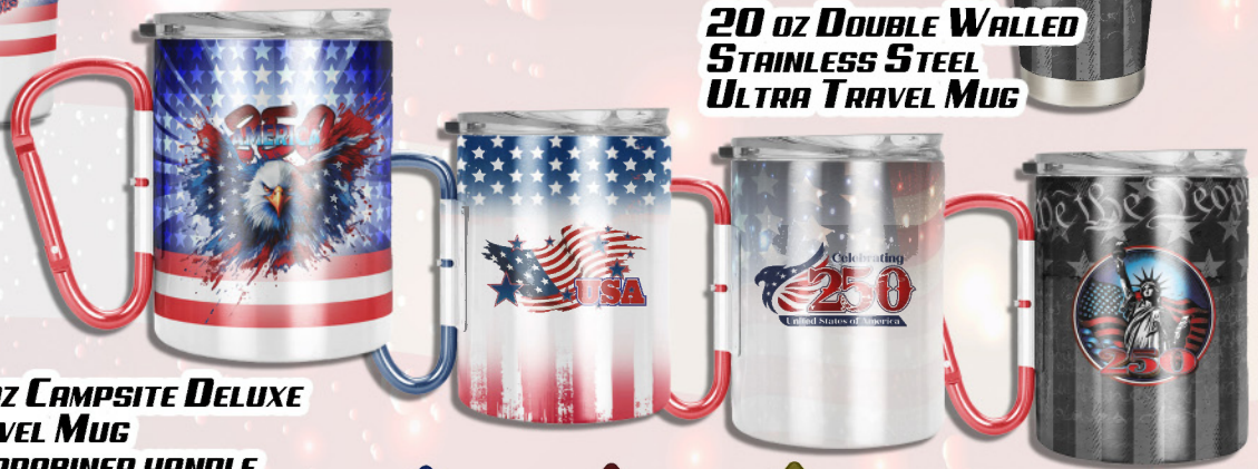
20 oz DOUBLE WALLED STAINLESS STEEL ULTRA TRAVEL MUG