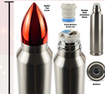
14" 32 oz DOUBLE WALLED BULLET THERMOS TUMBLERS FOR HOT OR COLD