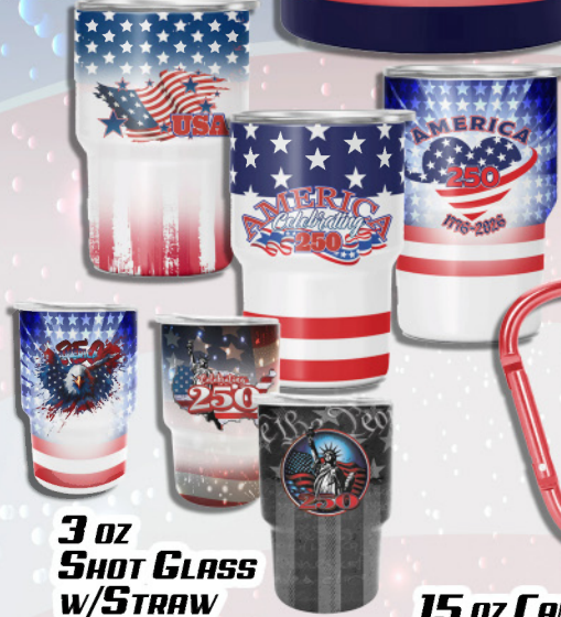
3 oz SHOT GLASS w/STRAW